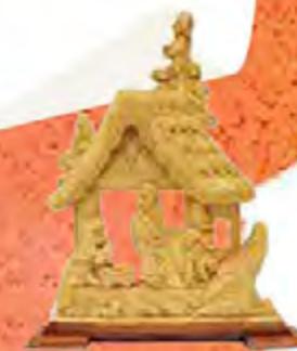
▲ Nativity Wood Carving Handmade in the Holy land