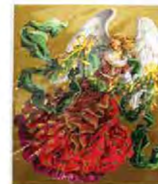
▲ Advent Calendar Card