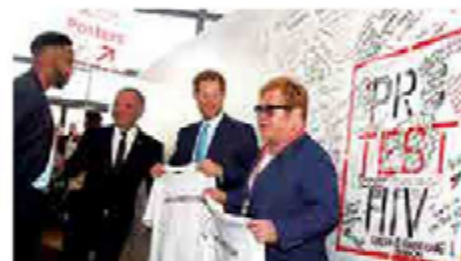
▲ Prince Harry and Sir Elton John joined forces by the "Pro Test" wall

HDH's clients and staff took a trip in late October to the Lohas Organic farm in Sheung Shui, a farm totally organic (from seeds all the way to harvest), to learn about organic farming, in conjunction with Alive Not Dead.