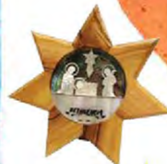
▲ Olive Wood Nativity on star, Handmade in the Holy land