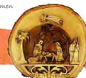
▲ Olive Wood Nativity Handmade in the Holy land