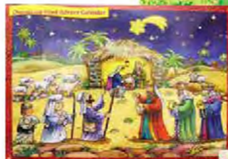
▲ Advent Calendar with 24 pieces of chocolates