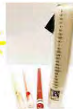
▲ Advent Candles