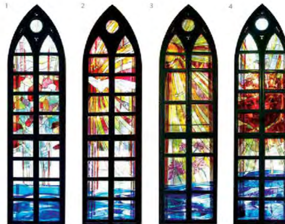
1/ The Tree of Life 2/ The Dove of Peace 3/ The Light of Grace 4/ The Love of God

The windows have a recurring blue theme in their lower segments, representing the Water of Life which is a symbol of the grace received in the Sacrament of Baptism and Hong Kong's connection to the sea.